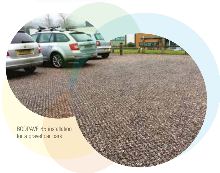
BODPAVE 85 installation for a gravel car park.