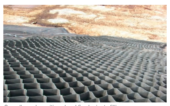
Geocell panels positioned and fixed prior to filling