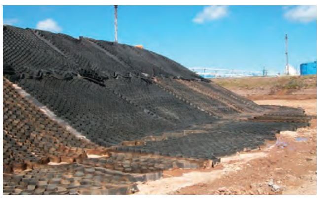
Geocell panels positioned and fixed prior to filling